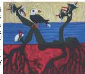
"Growth" by Linda Rae Coughlin, Fiber/Mixed Media

A portion of the proceeds from "The Earth Speaks" will be donated to the Woodbridge River Watch 501 (c) (3).