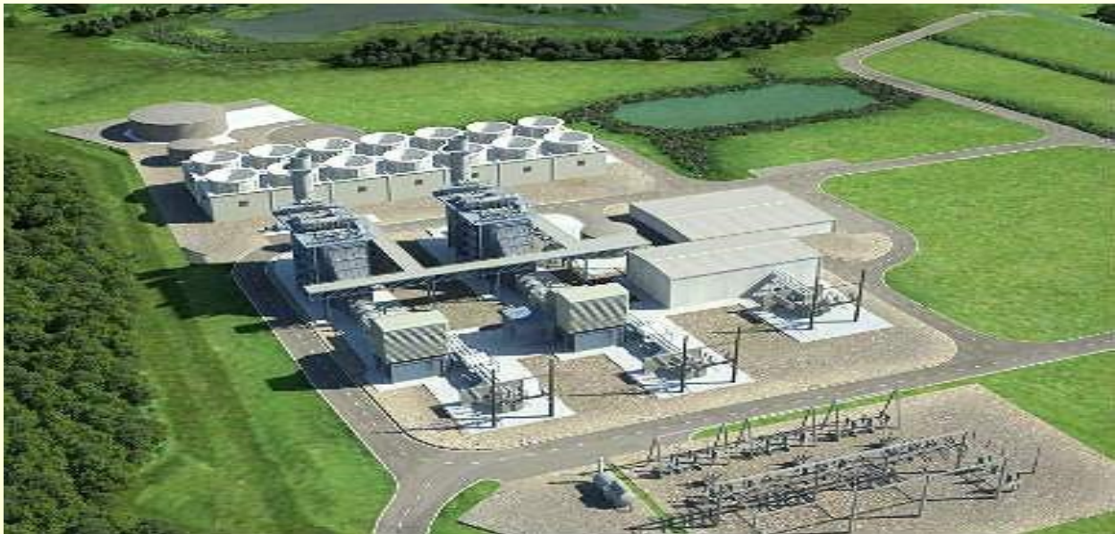
A rendering of the $845 million CPV Woodbridge Energy Center project.

One of the projects in the construction phase is the 27.28 acre parcel of the Former 185 acre Nuodex Corporation Site. This parcel will be developed into the Woodbridge Energy Center. This $845 million 700-megawatt natural gas-fueled facility generates enough electricity to power 700,000 homes, reduce the State's reliance on imported energy, reduce energy costs for residences and businesses, create over 500 construction jobs, generate $3.5 million in ratables, create 25 permanent jobs with a payroll of $50 million, and remediate/redevelop a former chemical contaminated site that has sat vacant and contaminated for decades.