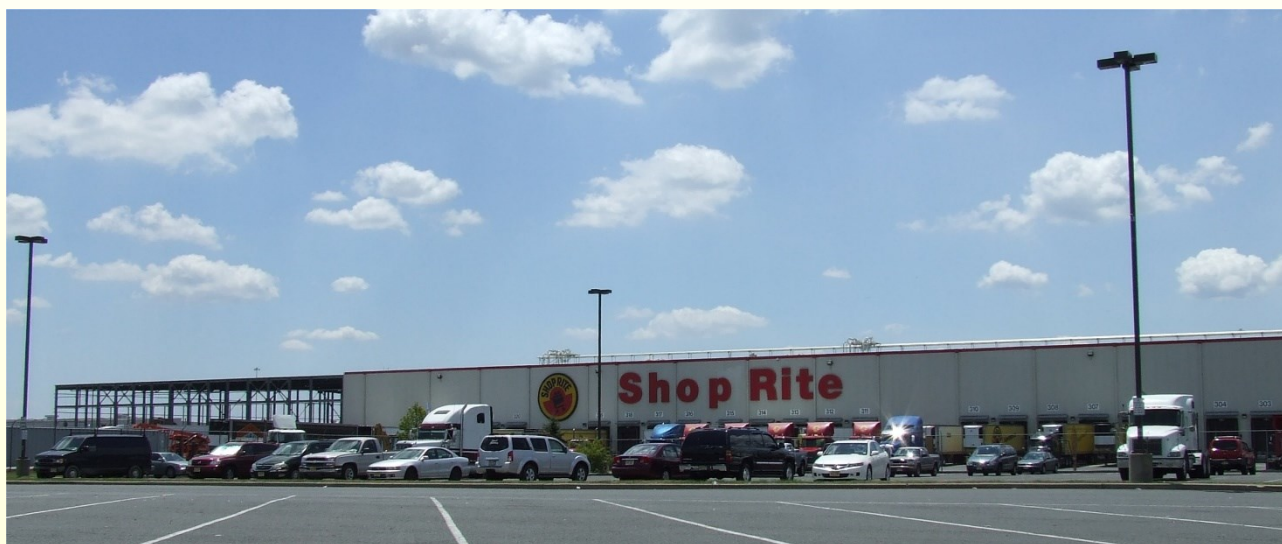
Photograph of the Wakefern Foods Distribution Center

Prior to its redevelopment as a distribution center, the Wakefern site had been part of a long-abandoned and vacant site previously owned by Center Realty. The site's history includes designation as a "U.S. Military Reservation" as part of the U.S. Army's Raritan Arsenal, formerly located on the Raritan River in Edison and Woodbridge Townships. The area was designated in need of redevelopment in 1996. In 2001, Wakefern Food Corporation, the largest retailer-owned cooperative in the United States, constructed a distribution center at the site, including a 487,209 square foot warehouse. In 2010, the warehouse underwent a 90,000 square foot expansion, which added 25 new loading dock doors, for a total of 100, increasing the warehouse's pallet capacity by 28 percent. The expansion further increased Wakefern's ability to service its 47 member companies, which individually own and operate more than 228 supermarkets under the ShopRite banner in New Jersey, New York, Connecticut, Pennsylvania, Maryland, and Delaware. The facility ships more than 1.5 million cases of product each week and handles all incoming and outgoing meat, dairy/deli, fresh bake, and appy deliveries for all ShopRite and PriceRite stores. The Wakefern facility is a PILOT project that has made significant contributions to Woodbridge Township projects and stands as a significant example of a productive development project that has benefited the economy of the entire Central Jersey region.