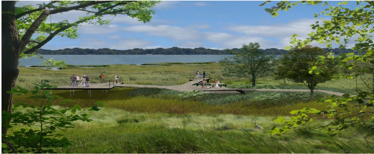
Renderings of the Woodbridge Wetland Park