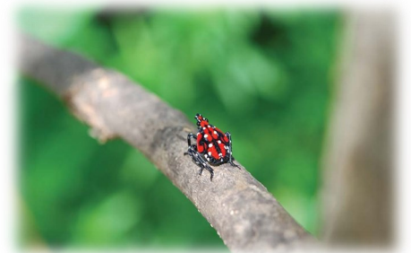
SLF Nymph Stage (April to Sept.)