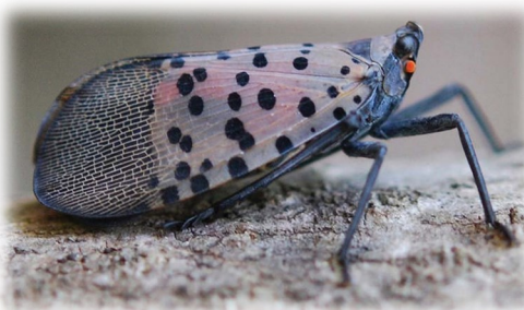
SLF Adlt Stage (July to December)