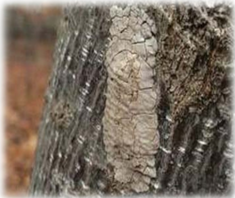
SLF Egg Masses (Sept. to April)

For more information, google NJ Department of Agriculture, Spotted Lanternfly and Penn State Extension, Spotted Lanternfly Management for Residents .