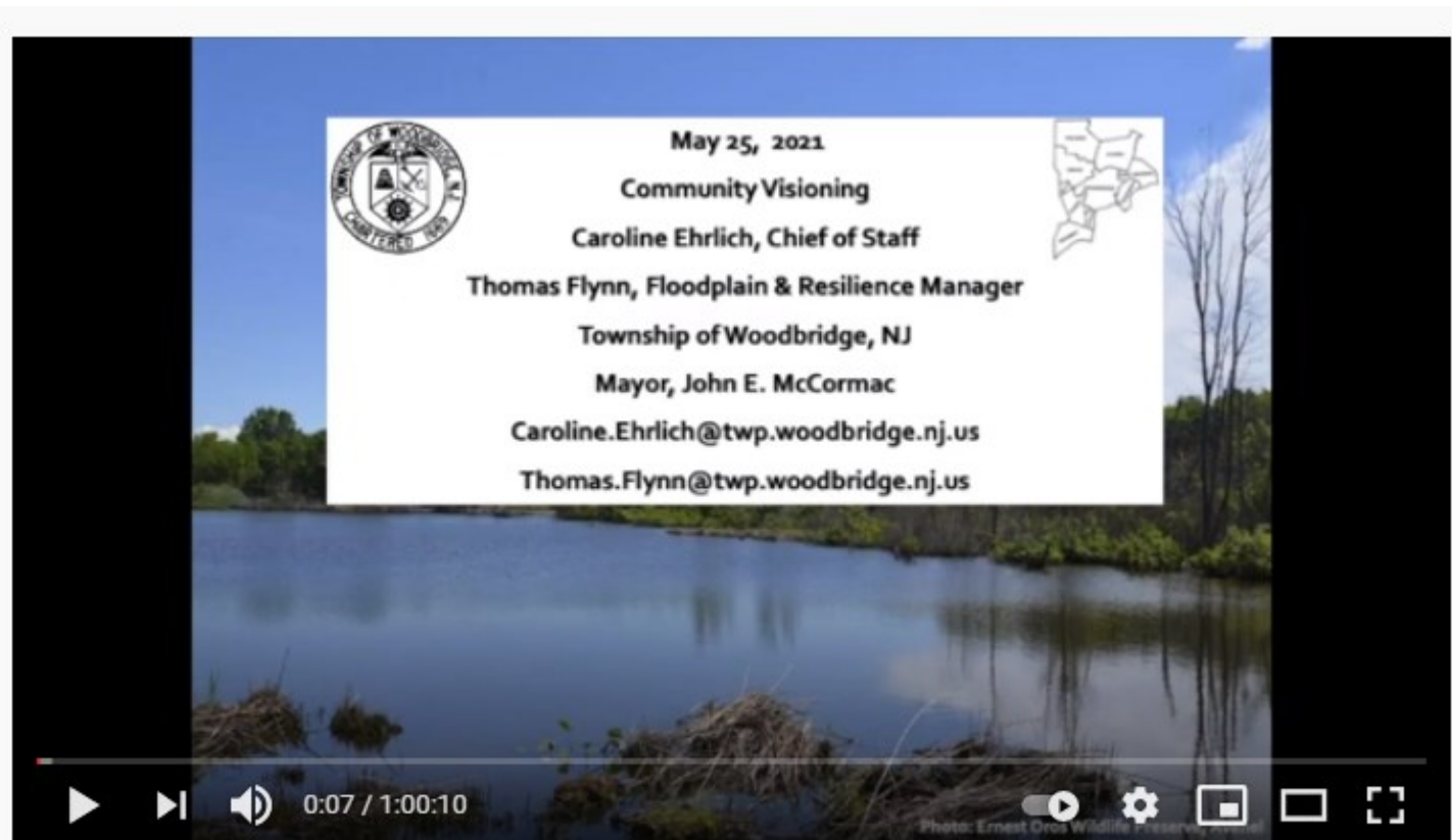
Green Visioning Meeting, May 25, 2021

https://www.youtube.com/watch?v=jLiH3RTaoCs