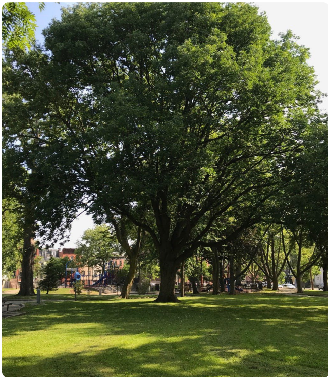
Photo: One of Jersey City's Largest Ash Trees ( Fraxinus americana ) at Arlington Park