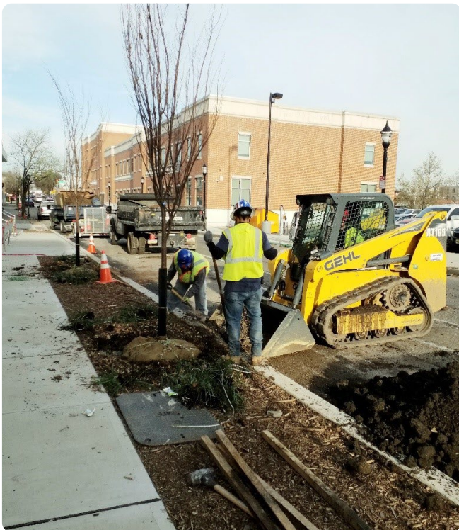
Photo: Tree planting contractors planting Zelkova serrata trees at the new City Hall Annex in Fall 2020

Since 2019, we have shattered the record for total tree planting with 415 in 2019 and 556 in 2020. The yearly tree planting average prior to 2019 was 143 trees over a 12-year period. Over the same time period, 194 trees a year were removed, on average. We have reversed this net-loss in trees as 245% more trees are being planted than removed. From 2019–2020 an average of 486 trees per year have been planted as opposed to an average of 198 trees removed from 2007–2020. If Jersey City maintains this tree planting initiative, I believe our shade tree canopy will begin to increase instead of decline over the next decade. (Please see attached database showing annual totals from 2007–2020.)