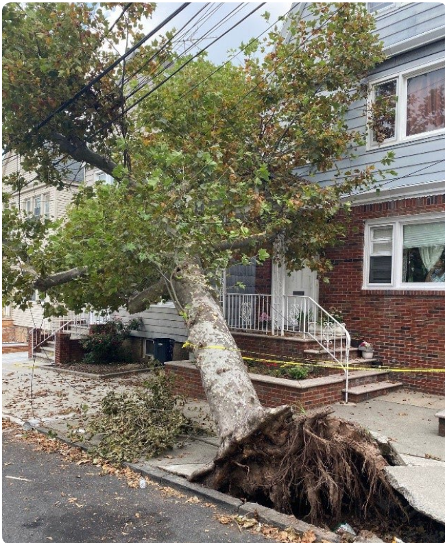
Photo: A large Platanus x acerfolia (London Plane Tree) that was uprooted due to Hurricane Isaias in August 2020

Hurricane Isaias which hit Jersey City on August 4th, 2020 caused widespread damage to many city trees. Over 30 trees toppled onto houses, cars, and utility lines. Hundreds of large branches failed causing many streets to be blocked for days.