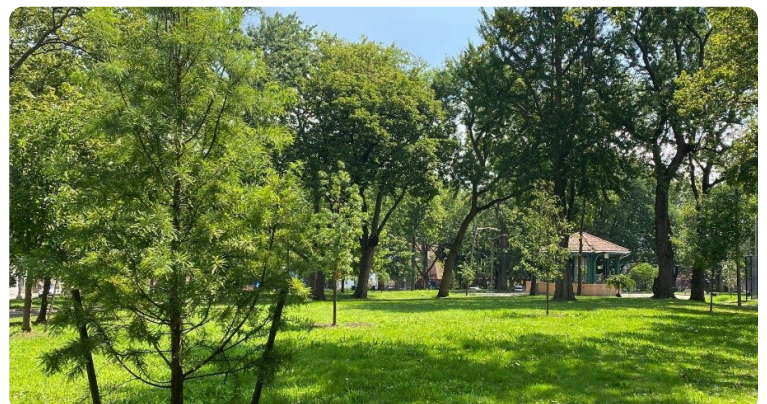
Photo: Mixed-age forest at Arlington Park, Jersey City