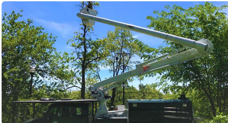
Jersey City Forester pruning trees in Bayside Park July 2020

Regardless of the obstacles, 2020 was overall a successful year for Jersey City Urban Forestry. We were able to achieve some of our Community Forest Management Plan objectives such as building a professional tree inventory, no net loss in trees, tree ordinance revisions, and improved community education and engagement. There are still many factors concerning our urban forest that can be improved upon and these issues will be addressed in future years and outlined in future management plans. 2021 will be a new year with new obstacles; however, we look forward to taking another step forward to building a sustainable and resilient urban forest.