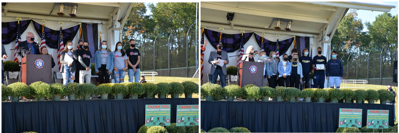
Mayor & Municipal Council recognizing the Students from Woodbridge & Colonia at a COVID-19 Hero Appreciation Ceremony

Colonia Cares: https://www.youtube.com/watch?v=VVgov4J57Ww