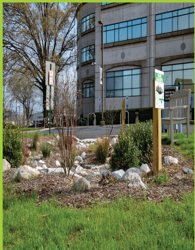
Town Hall Rain Garden