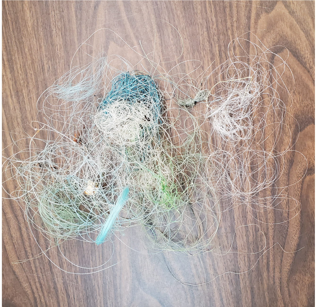
Monofilament — Removed from collection station

Tonnage was minimal in 2021 (and typically is yearly) — only about a pound or two. However, this specific endeavor is not heavily weighted based on pounds. In this instance, the merit is about keeping the product out of the environment and recycling what is collected, and our Township team is proud to do so.