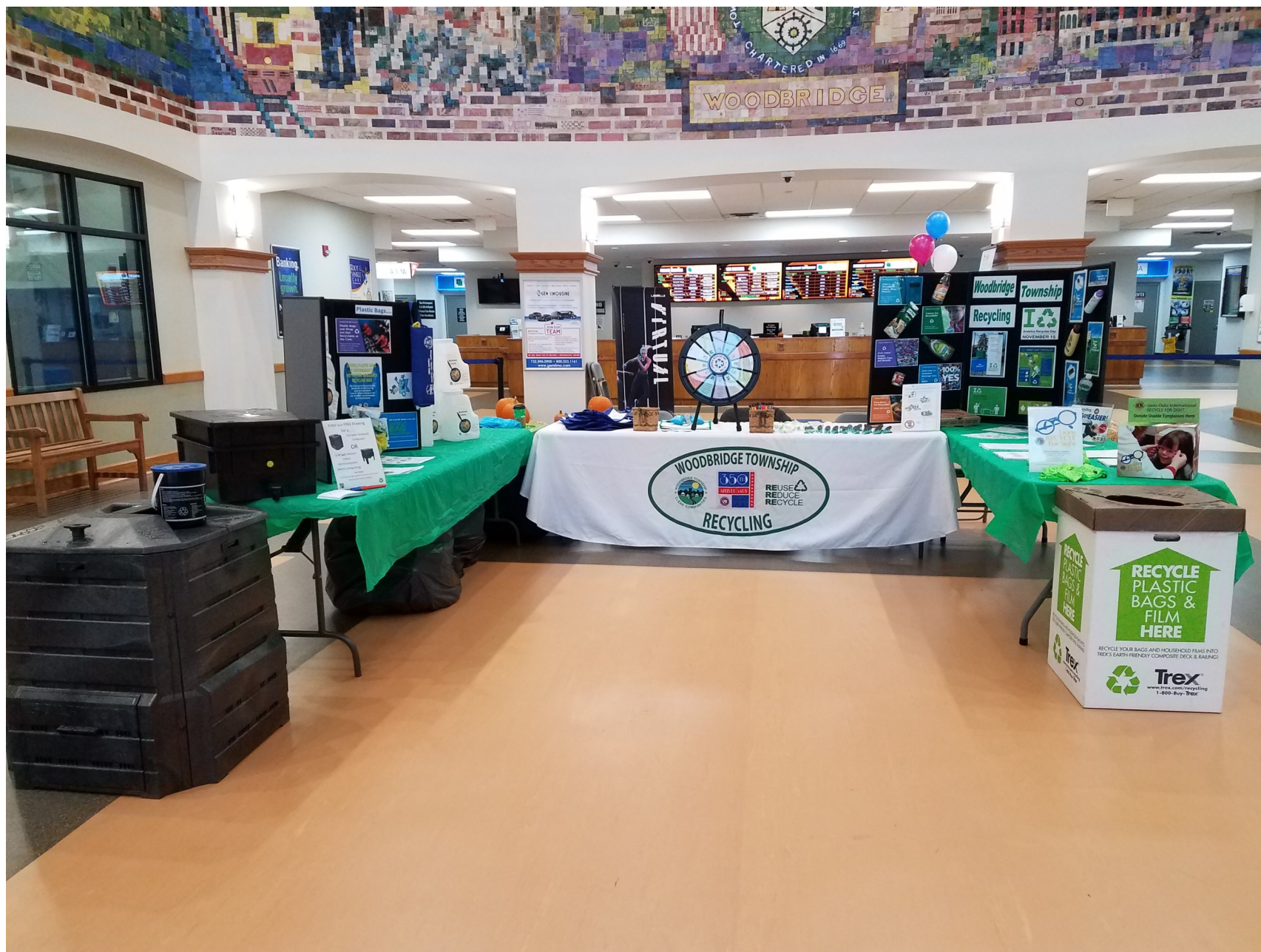
America Recycles Day - Outreach Table