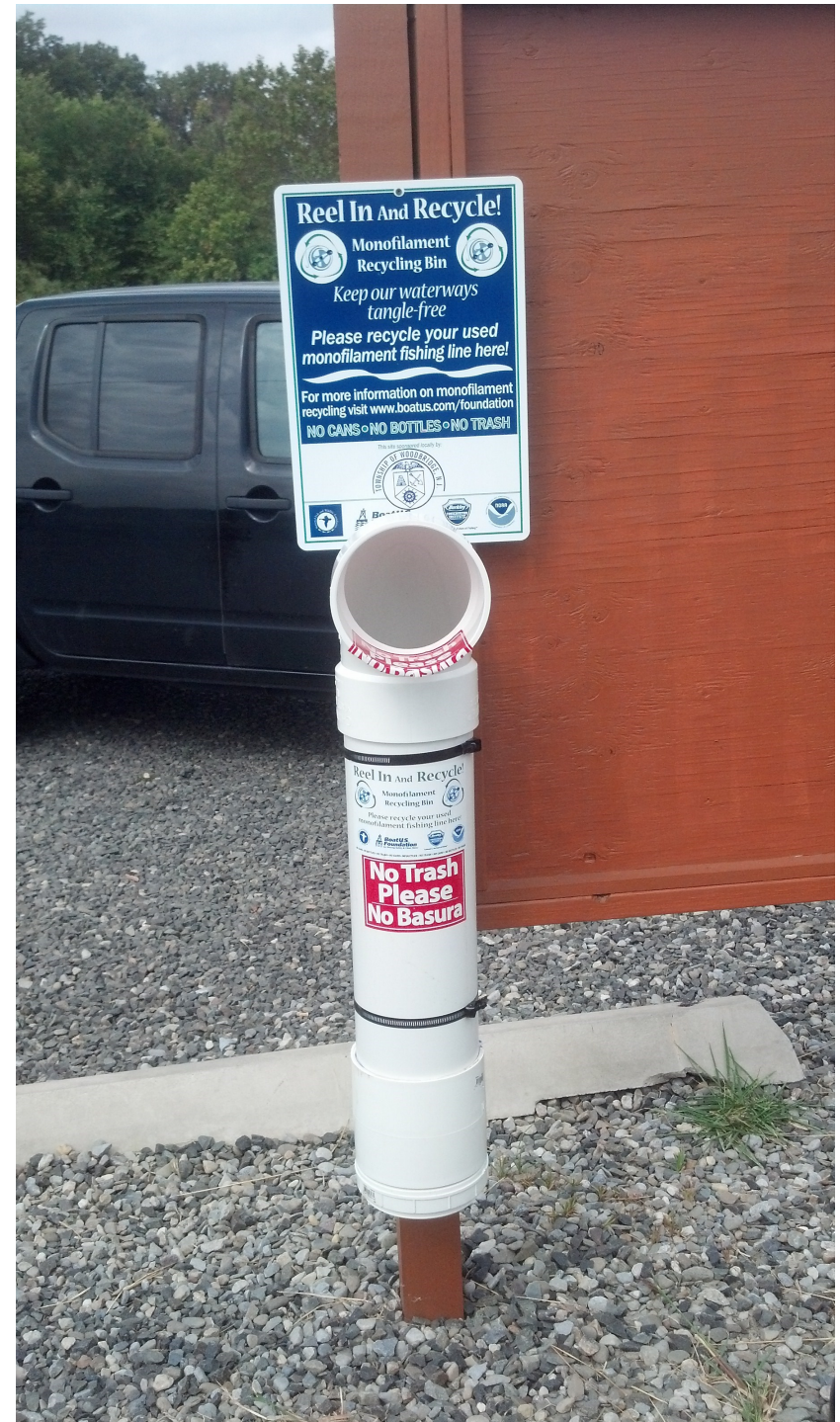
Monofilament — Sewaren Municipal Marina