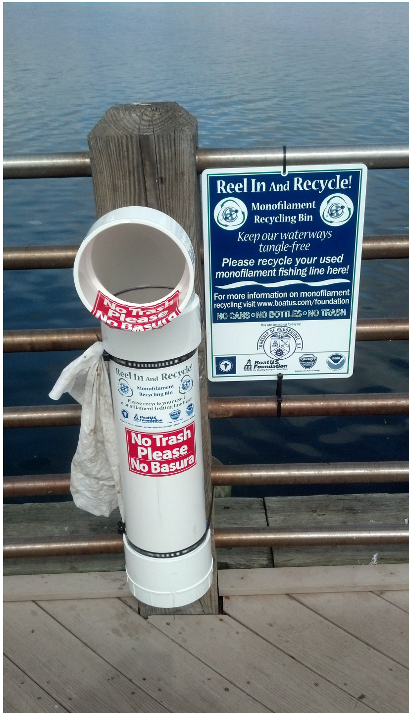
Monofilament — Sewaren Boat Launch