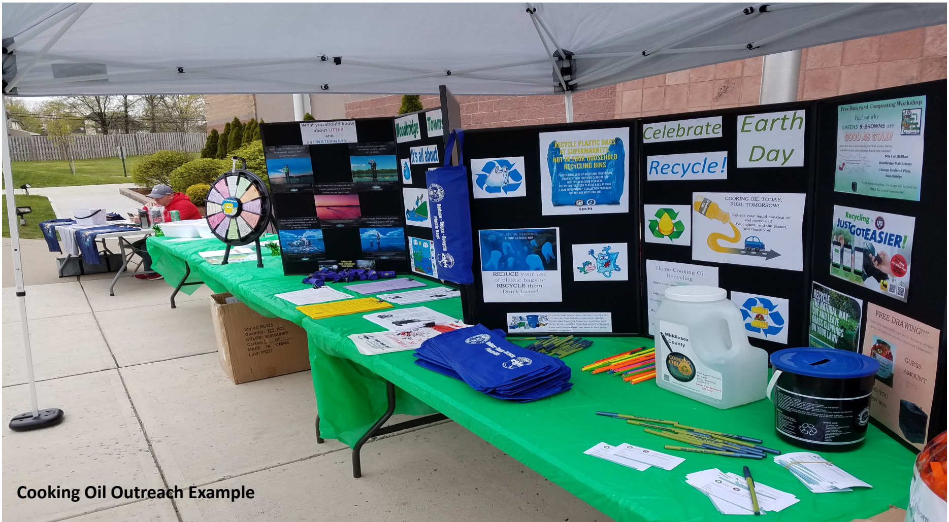
Cooking Oil Outreach Example